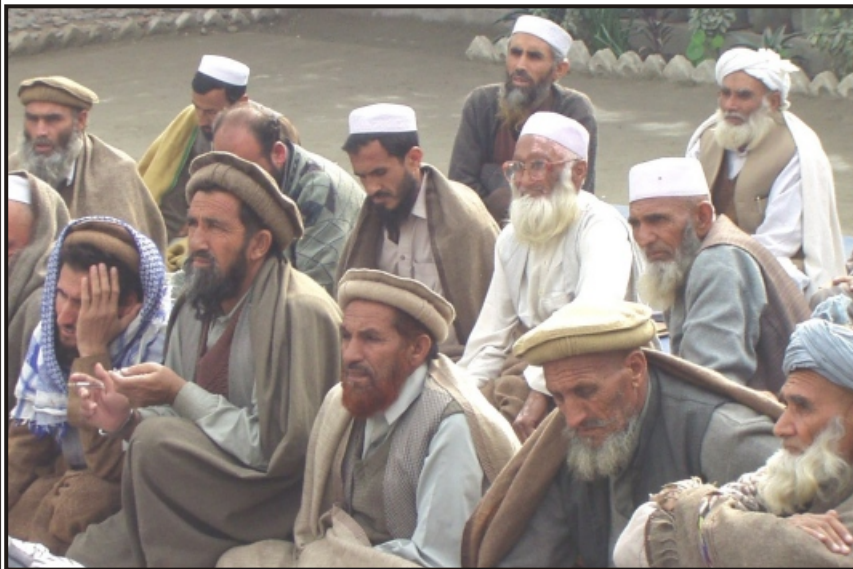
Spin Ziri or White bearded elderly Pukhtoons at a Community Conference in Afghan Refugee Camp near Peshawar.